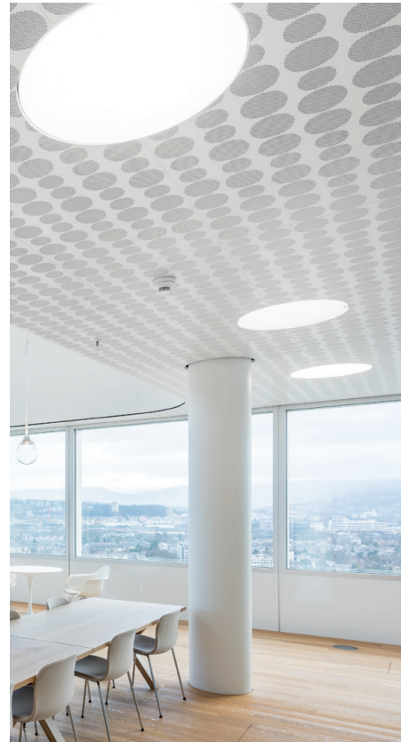
Solo Slim recessed luminaire

HARMONIOUS IN TERMS OF BOTH SHAPE AND ILLUMINATION, SOLO SLIM INTEGRATES ELEGANTLY INTO ANY ARCHITECTURE THANKS TO ITS ROUND DESIGN AND SLIM FRAME HEIGHT. THE SEAMLESS SURFACE AND PERFECTLY FINISHED HOUSING MAKE SOLO SLIM AN AESTHETIC AND HIGHLY EFFICIENT LUMINAIRE.