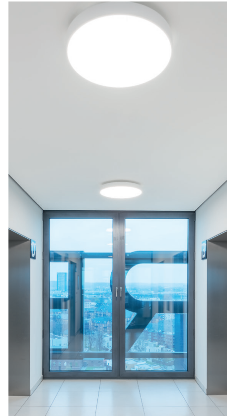
Solo Slim mounted luminaire