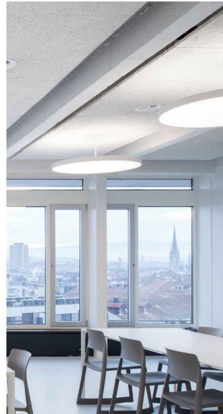
Solo Slim pendant luminaire

Available as a recessed, mounted and pendant luminaire, the slender Solo Slim offers a wide range of potential uses. The luminaire is also available with microprismatic optics for use in offices. The tunable white version guarantees dynamic daylight-dependent lighting.